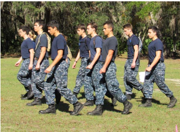
DRILL, DRILL, DRILL