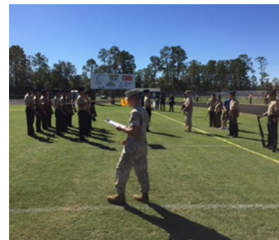
REGIONAL DRILL MEET

Trophies were awarded at the Nease HS Regional Drill Meet on Jan. 14. Fifteen schools participated in the competition for which our council contributed towards the purchase of trophies.